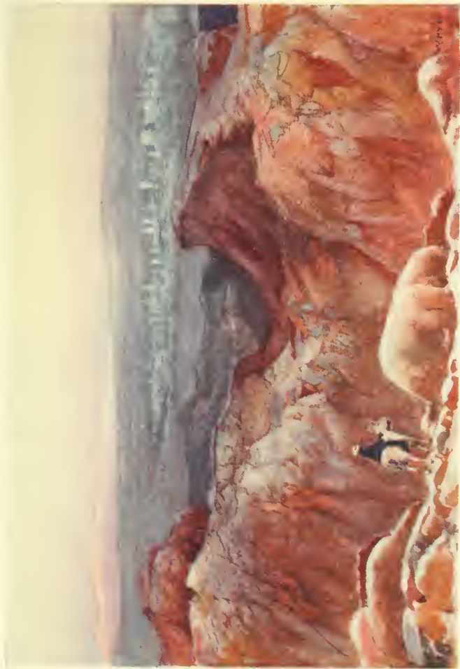
UPON A BLUE FIELD LAY VALLADOLID.